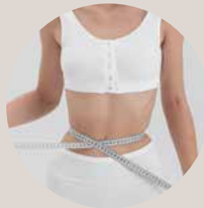
Underweight (BMI <18.5)